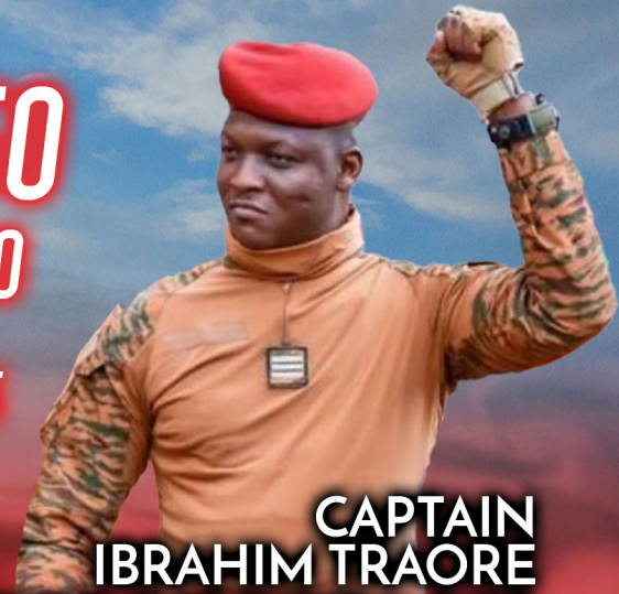
CAPTAIN IBRAHIM TRAORE PRESIDENT OF BURKINA FASO